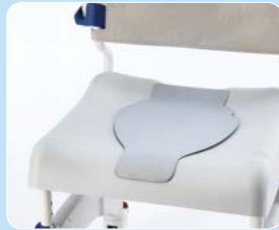
Soft seat insert