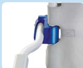
Wider XL armrests