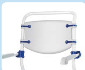
Solid plastic backrest