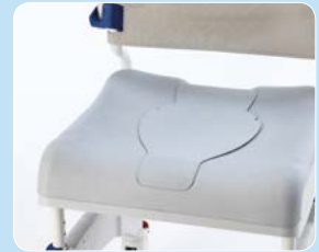
Small soft seat insert