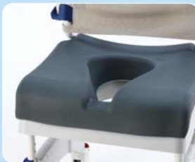
Ergonomic soft seat