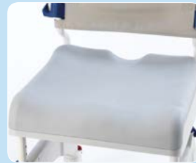
Universal soft seat