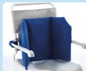
Soft backrest cushion ▲