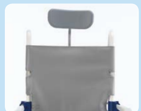
Comfort backrest ▲