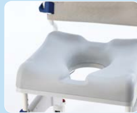
Small soft seat