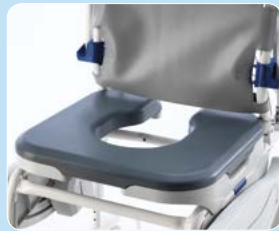
Variable soft seat