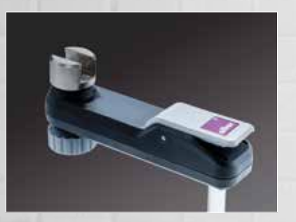
Lightweight Alber swivel arm