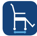
Seat depth ▼