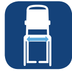
Seat width ▼

For more comprehensive pre-sales information about this product, including the product's user manual, please see your local Invacare website.