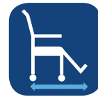
Total depth ▼