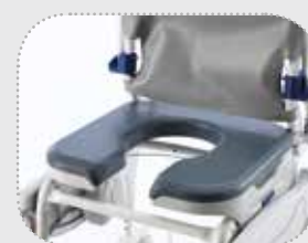
Seating and Backrests