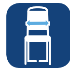
Width between armrests ▼