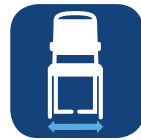
Total width ▼