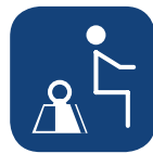
Load capacity ▼