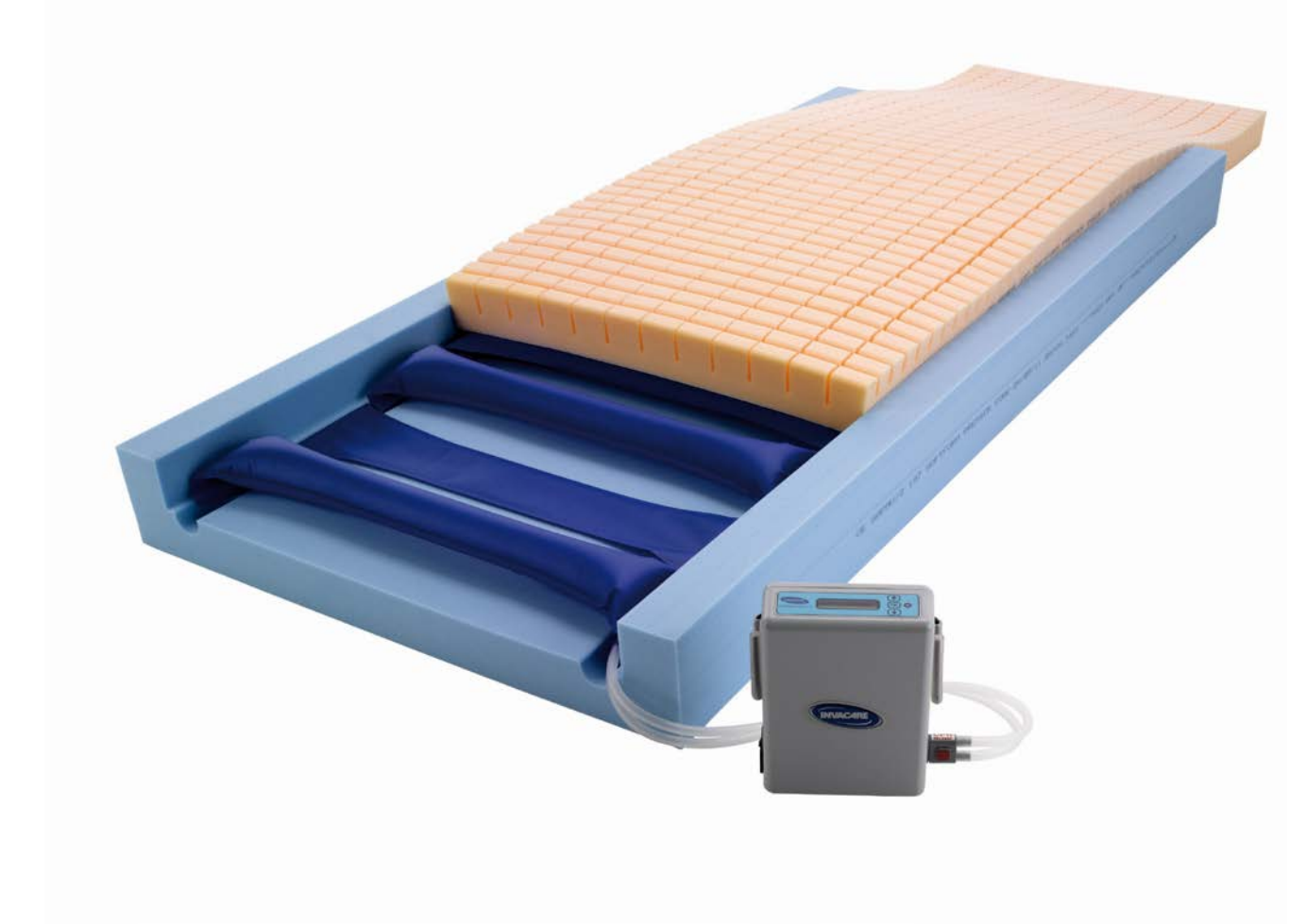
Invacare's Softform Premier Active 2 (SPA2) is the only mattress used at