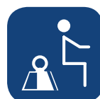
Max. User Weight ▼