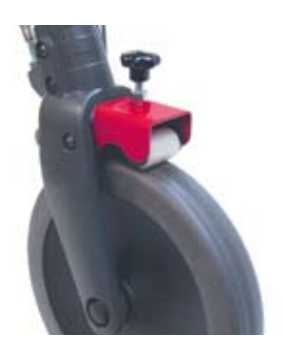
Slow-down brake A safety feature preventing the walker from rolling away.