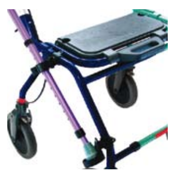
Cane holder Makes the cane easily accessible without getting in the way.