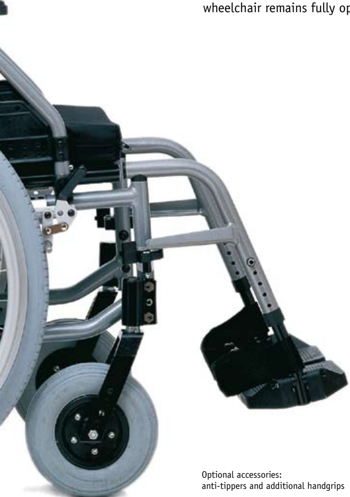
Optional accessories: anti-tippers and additional handgrips

The powerful electric motor is tucked away under the seat and held by a quick-lock device. The handy rechargeable battery pack is securely attached to the drive and is automatically locked into position. To charge the battery pack, there is an automatic charger supplied. The viamobil is operated by an ergonomically designed control unit.