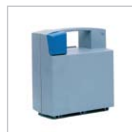
Rechargeable battery pack