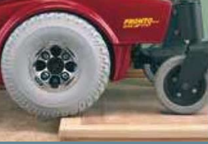
Features and Options