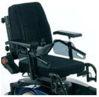
A range of seating options are available including the Laguna seat and back style.