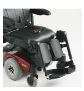
A range of angle adjustable legrests and footplates available. (Configured version only)