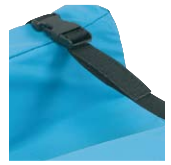
Adjustable side-squeeze clip buckles

The cover can be unzipped and removed from the foam core to allow laundering of the cover.