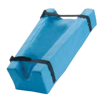
Heavy duty water-resistant cover

Elevates the heels and allows them to be suspended over the edge of the trough, providing pressure relief for the vulnerable heel area.