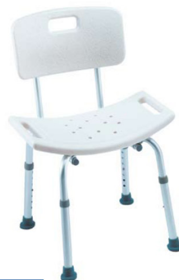
Invacare H296 Cadiz