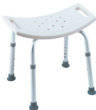
Invacare H291 Cadiz