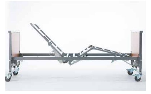
Optimised dimensions of mattress platform

The homely design of Medley Ergo Select can also be retro-fitted (optional).