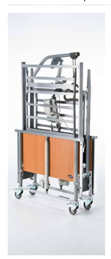
Easy to transport

All Medley Ergo beds are easy to assemble and dismantle and can be transported using transporter kits (optional).