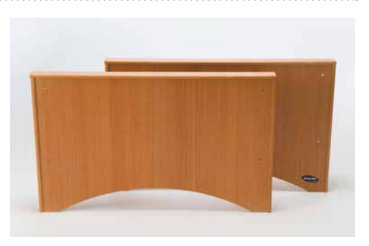
Select design for Medley Ergo

Adjustable height range for Medley Ergo Low 210-610mm or 280-680mm.