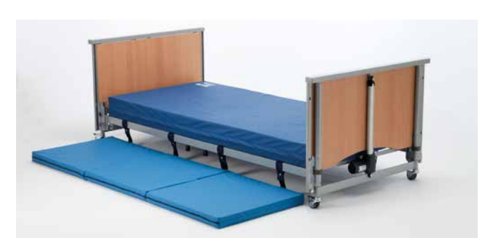
Safety in and out of bed

A range of collapsible three quarter length steel side rails, available in various heights to cover standard to deep mattress heights.