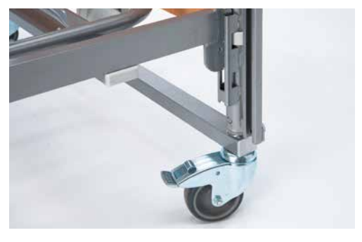
Double height positions for bed ends

Can be adjusted in both height and depth (optional).