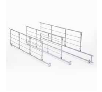
Scala 2 range

Available with wooden or steel full length side rails. Wooden extendable side rails (150mm) are also available.